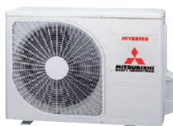
SRC20ZS-W, SRC25ZS-W2 SRC35ZS-W2