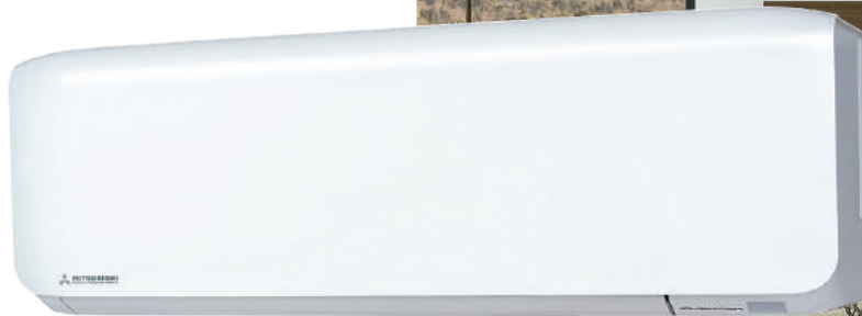
SRK20ZS-WF, SRK25ZS-WF, SRK35ZS-WF, SRK50ZS-WF